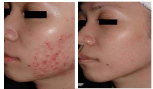
8 Weekly Active Acne Photo Facials